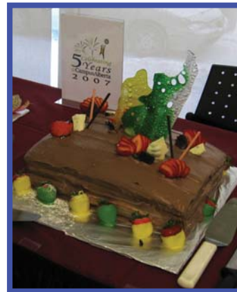
▲ The eCampusAlberta birthday cake didn't last long once hungry folks at Red Deer College got ahold of it.